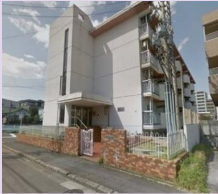
Exterior view of the dormitory

Self-contained private flat, furnished (desk, chair, closet (Japanese style), futon bedding, refrigerator, gas stove, microwave, washing machine, bathroom (toilet and bath), A/C, Wi-fi available.