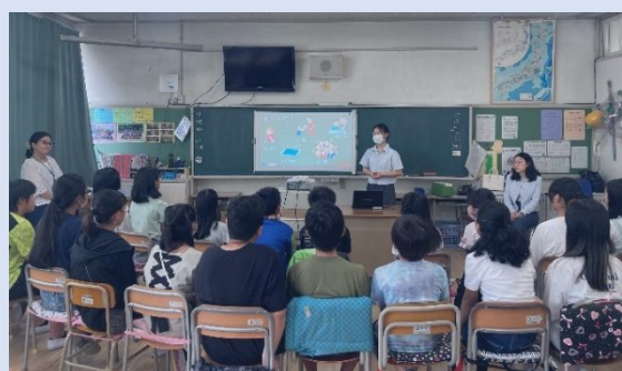
Presentation at local school